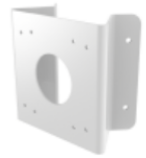
NWP-CM Corner Mount