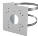
NWP-PLM Pole Mount