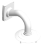
NWP-WB Wall Mount