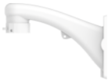
NWP-WB Wall Mount