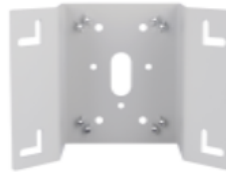
NWP-CM Corner Mount